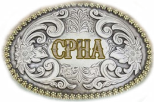
California Paint Horse Association www.californiapainthorseassoc.com

CPHA/SJPHC SoCal Spring APHA & All Breed Horse Show brought to you by the volunteers of