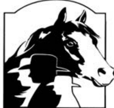
San Joaquin Paint Horse Club www.sjphc.net